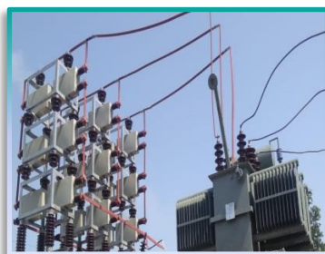
HT Passive Harmonic Filters

Our manufacturing unit is located at Vasai in Maharashtra. Our manufacturing facility is equipped with requisite infrastructure including machinery, other handling equipment to facilitate smooth manufacturing process. We endeavour to maintain safety in our premises by adhering to key safety norms. Our manufacturing process is integrated from procurement of raw materials to final testing. We believe in manufacturing and delivering quality products and are dedicated towards supply of quality products by controlling the procurement of standard raw material, monitoring the process parameters, maintaining appropriate measures to manage hazardous materials and to comply with applicable statutory and regulatory requirements of our products. It is the diligent efforts of our personnel, that we have been able to streamline our business operations.