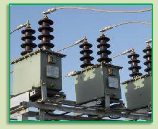
MV Current and Voltage Transformer upto33 kV