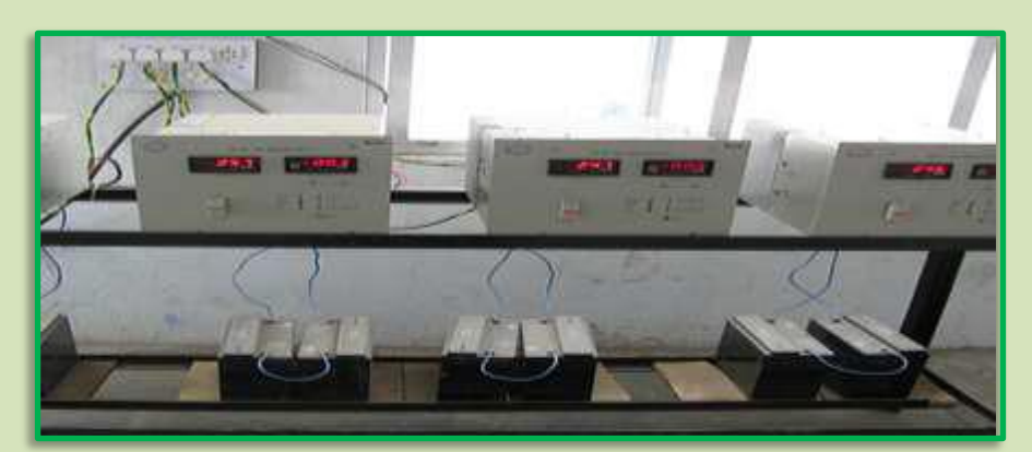
Battery and Battery Chargers