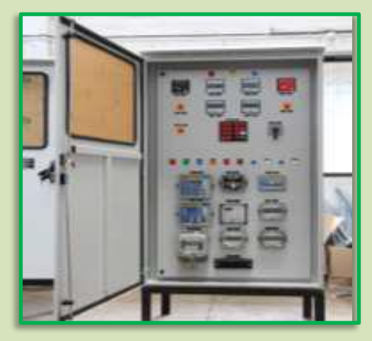
Control and Relay Panels